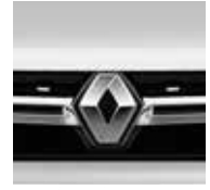
WHITE (NON METALLIC)