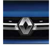
COSMOS BLUE (METALLIC)