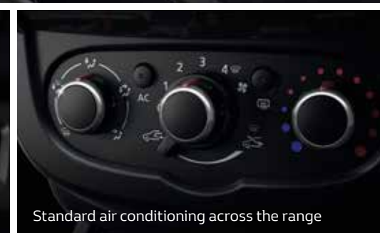
Standard air conditioning across the range