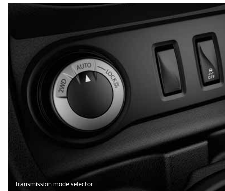
Transmission mode selector