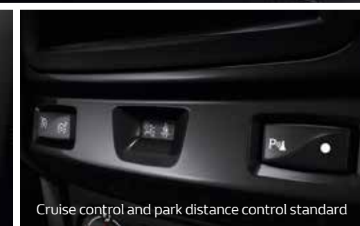
Cruise control and park distance control standard