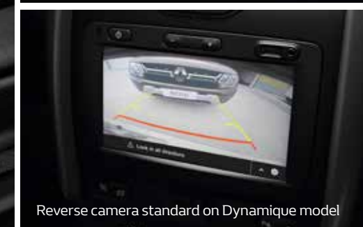
Reverse camera standard on Dynamique model