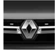
COMET GREY (METALLIC)