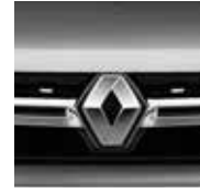
PLATINUM SILVER (METALLIC)